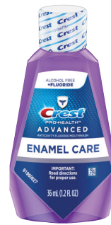
Crest® PRO-HEALTH™ Advanced Enamel Care Mouthwash Two cases of 48, 36mL bottles