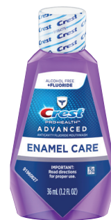
Crest® PRO-HEALTH™ Advanced Enamel Care Mouthwash Four cases of 48, 36mL bottles