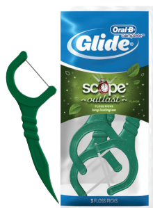
Oral-B® Glide™ Scope® Floss Picks Four cases of 72, 3-ct. sachets