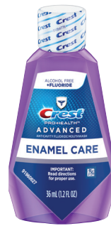
Crest® PRO-HEALTH™ Advanced Enamel Care Mouthwash Two cases of 48, 36mL bottles